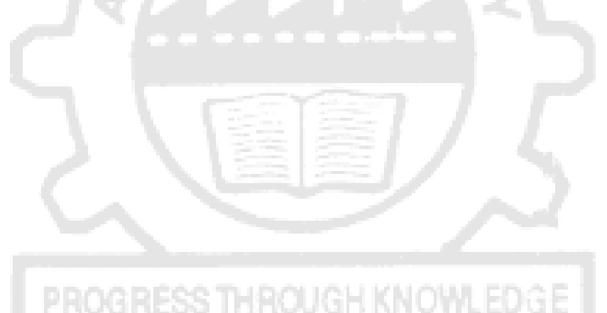
Centre for Academic Courses Anna University, Chennai-600 025