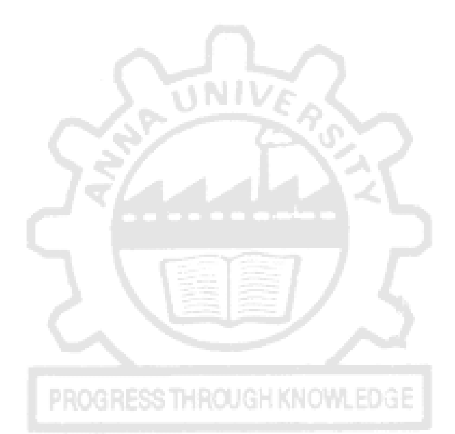
Centre for Academic Courses Anna University, Chennai-600 025