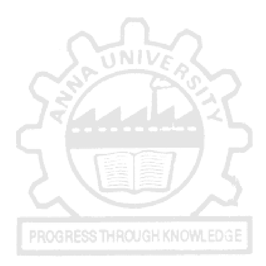
Centre for Academic Courses Anna University, Chennai-600 025