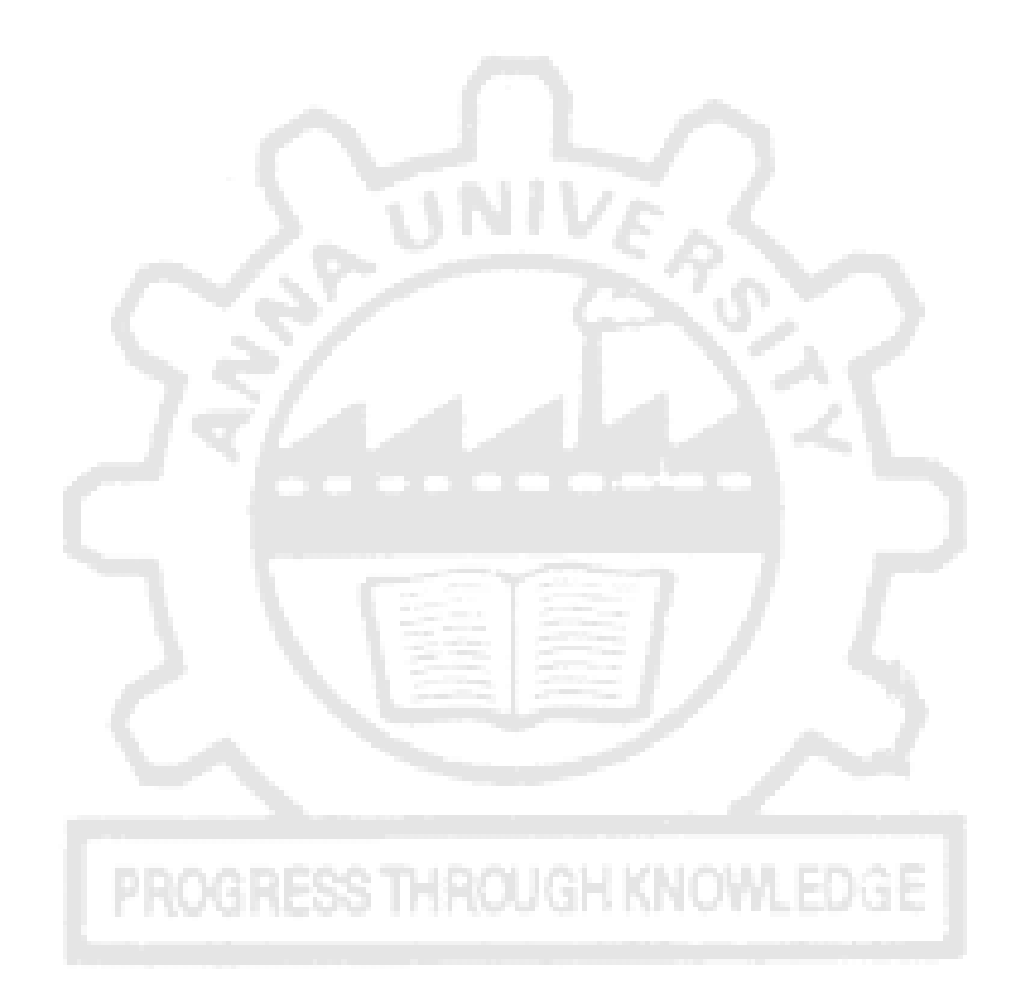
Centre for Academic Courses Anna University, Chennai-600 025