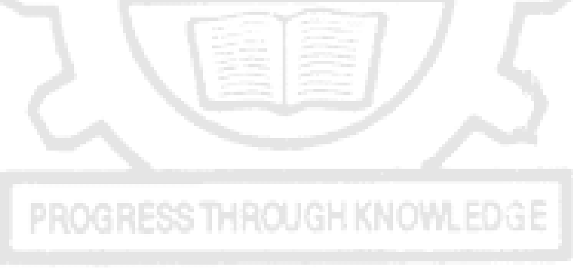
Centre for Academic Courses Anna University, Chennai-600 025