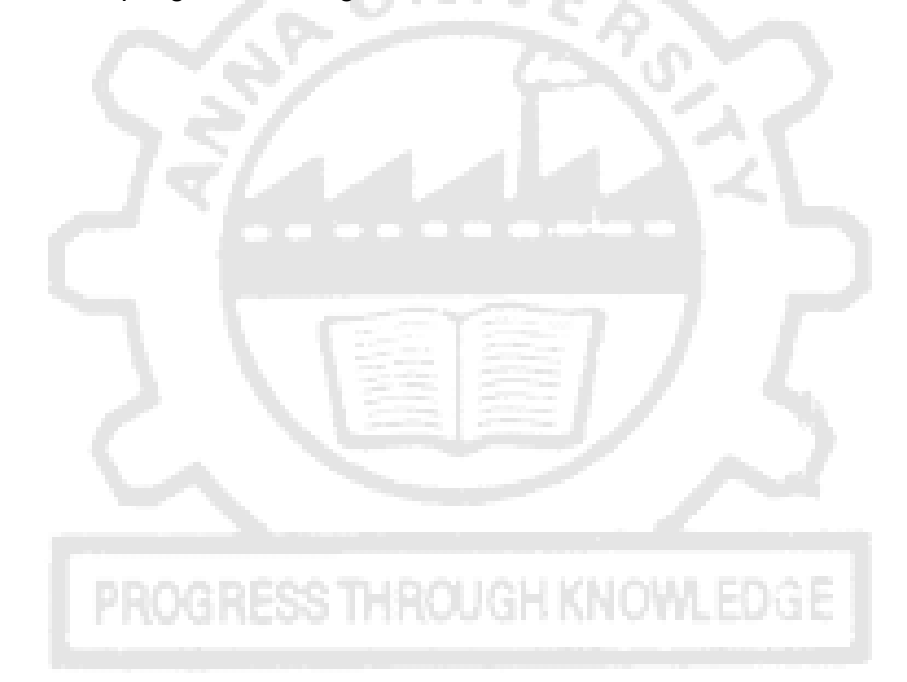
Centre for Academic Courses Anna University, Chennai-600 025