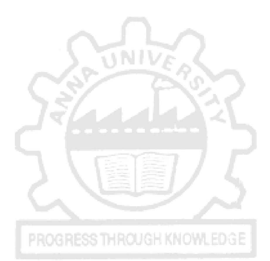
Centre for Academic Courses Anna University, Chennai-600 025