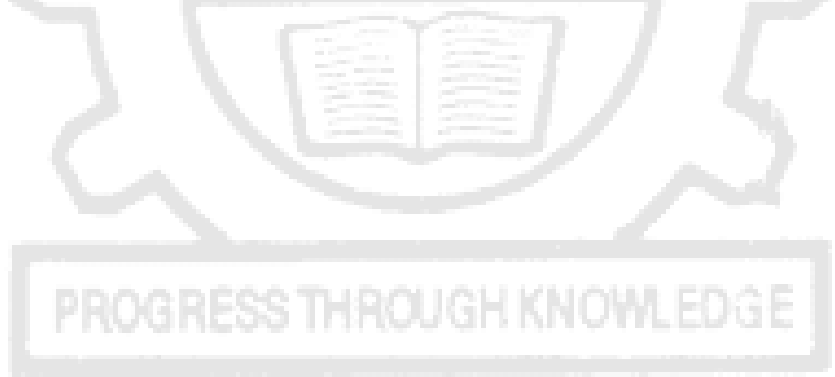
DIRECTOR Centre for Academic Courses Anna University, Chennai-600 025

1, 2 and 3 are correlation levels with weightingsas Slight (Low), Moderate (Medium) and Substantial (High) respectively