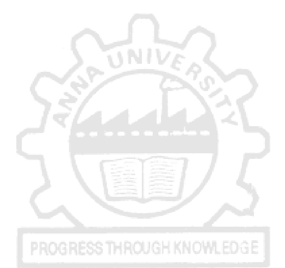
Centre for Academic Courses Anna University, Chennai-600 025