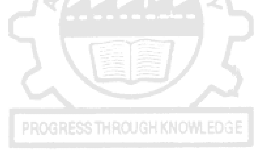
Centre for Academic Courses Anna University, Chennai-600 025

CO2: Report generation using ERP software