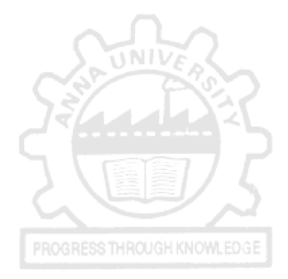
DIRECTOR Centre for Academic Courses Anna University, Chennai-600 025