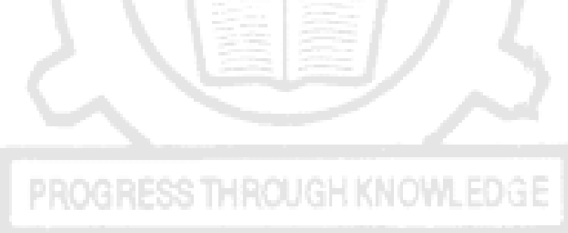
Centre for Academic Courses Anna University, Chennai-600 025

1, 2 and 3 are correlation levels with weightings as Slight (Low), Moderate (Medium) and Substantial (High) respectively