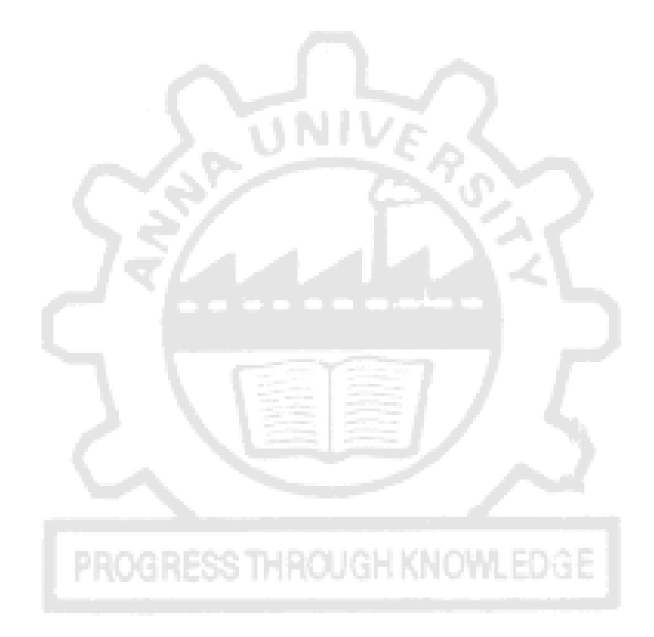
Centre for Academic Courses Anna University, Chennai-600 025