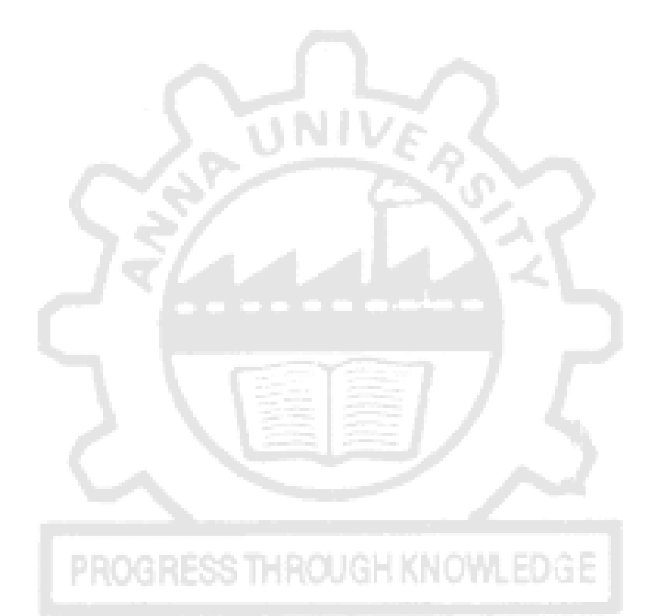
Centre for Academic Courses Anna University, Chennai-600 025