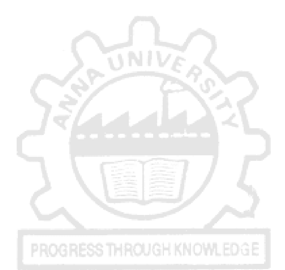
Centre for Academic Courses Anna University, Chennai-600 025