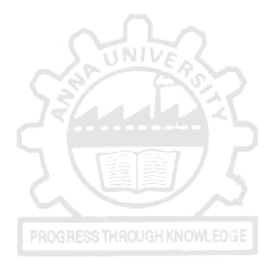
Centre for Academic Courses Anna University, Chennai-600 025