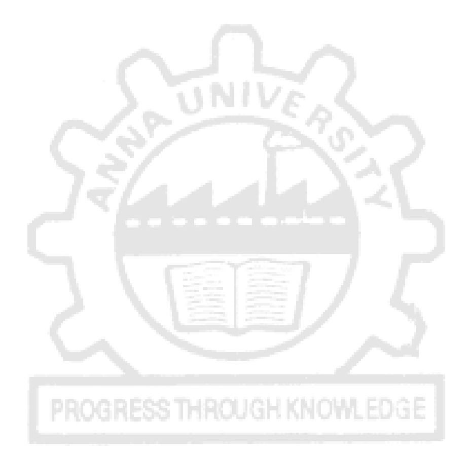
Centre for Academic Courses Anna University, Chennai-600 025