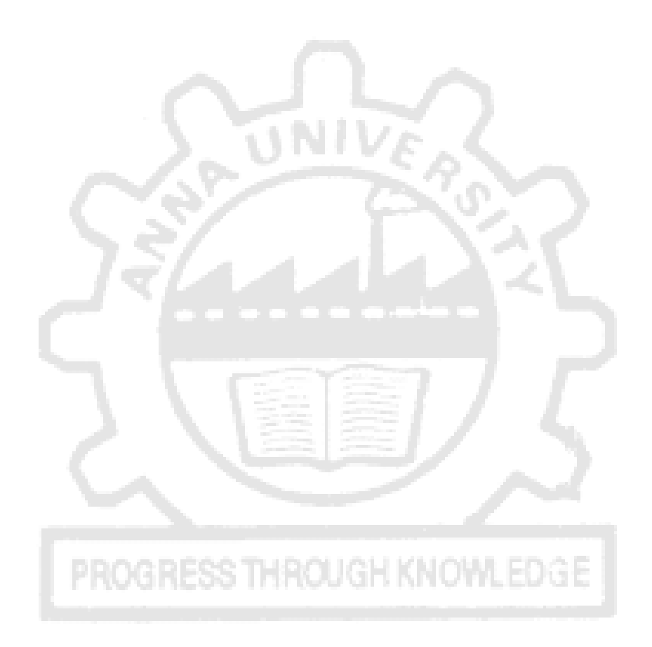
Centre for Academic Courses Anna University, Chennai-600 025