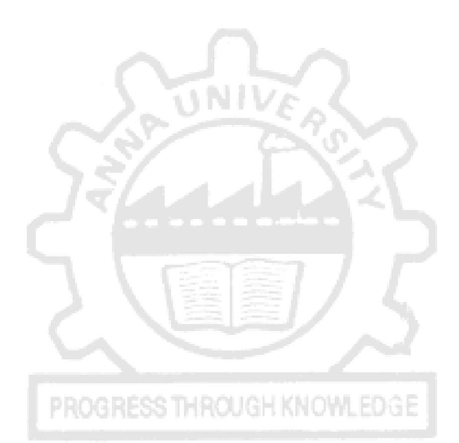
Centre for Academic Courses Anna University, Chennai-600 025